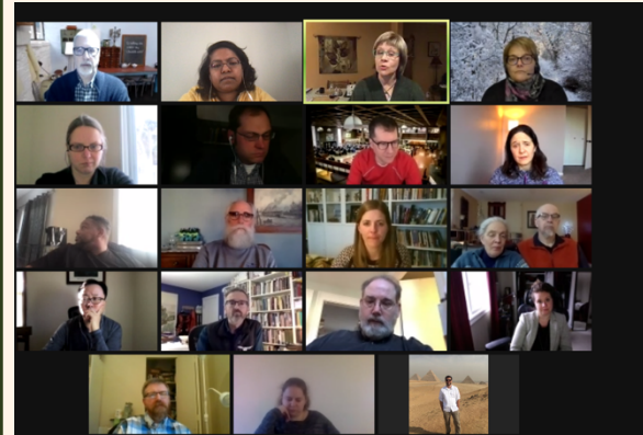
Spending time with other CRC campus ministers on ZOOM!