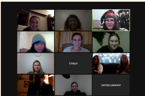
We watched "Home Alone" with a group of students before exam week...eating the popcorn from one of the days of Christmas!

God has continually made the way. He has given favour, strength, mercy, and grace in every step. I've hung out with graduate students for virtual coffee (for something called "Sip and Chat"). I've even had the opportunity to sit in on a graduate thesis defense online! I've learnt so much as the Chair of our UNBC Interfaith Spiritual Care Centre. I've had the joy of praying with a faculty member regularly on Thursday mornings. I have been so humbled and have felt amazingly supported