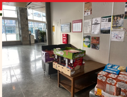
Goodies for the "goodie bags"!