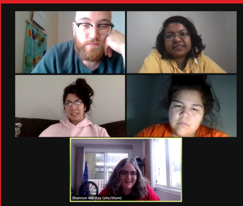
Hanging out with UNBC First Nations Centre staff and students.