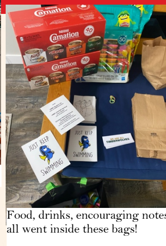
Food, drinks, encouraging notes all went inside these bags!

Yet another highlight! This semester CRC Campus Ministry partnered with two UNBC departments to provide pre-exam stressbuster "goodie bags" (especially for students in residence). These bags included food/drink items, coloring pencils, coloring